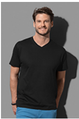
ST2300 Classic-T V-neck